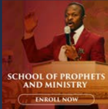
Enrol Now for School of Prophets & Ministry

Weekly video teachings on how to activate and sharpen your prophetic gifting