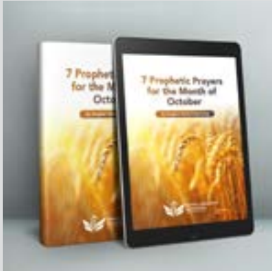
Prophetic Prayer for Month of October eBook