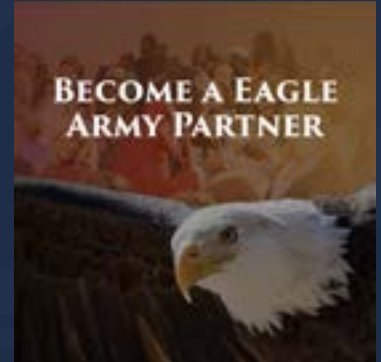
Become a Eagle Army Partner

Weekly video teachings on how to activate and sharpen your prophetic gifting