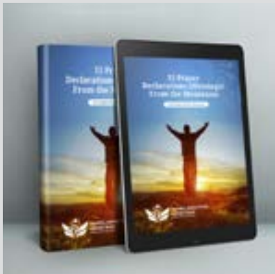
15 Prayer Declarations (Blessings) From the Mountains eBook